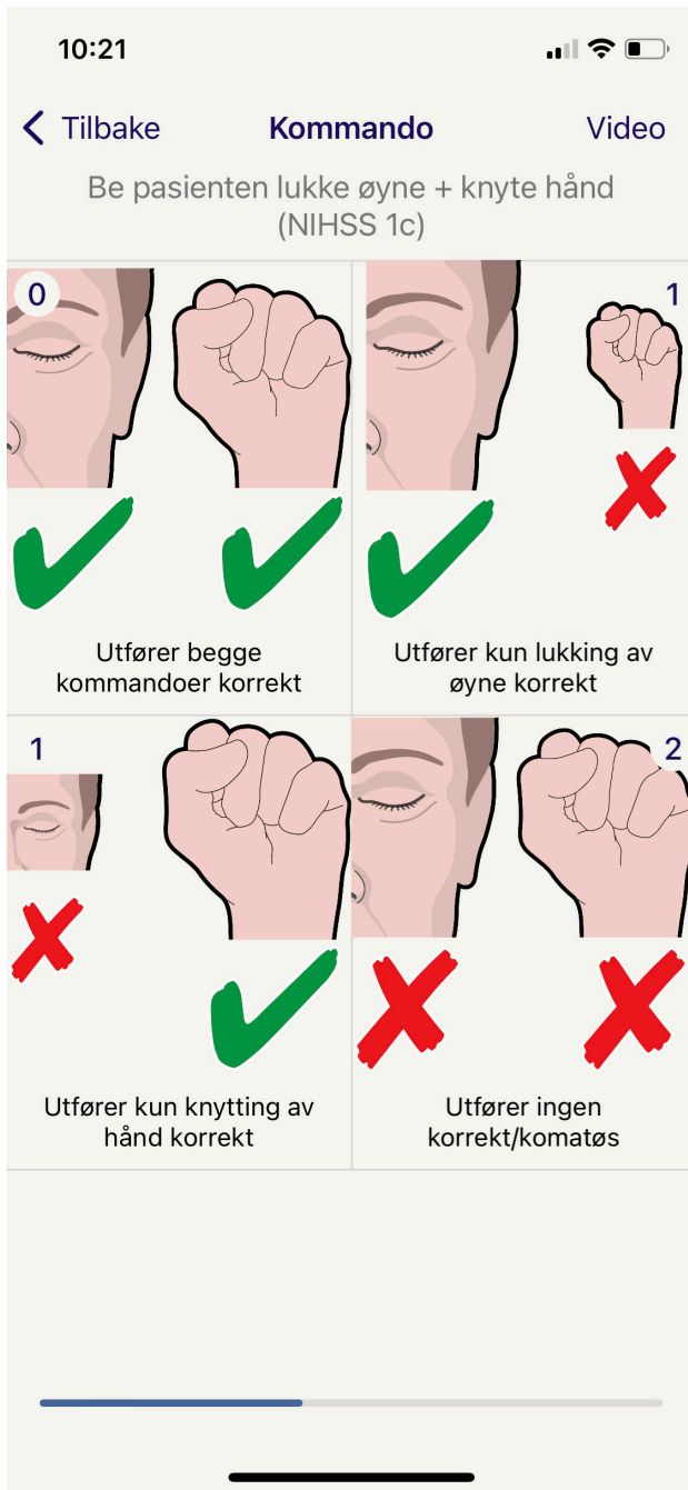
Figure 1 Level of consciousness command 1c as shown in application. NIHSS, National Institutes of Health Stroke Scale.